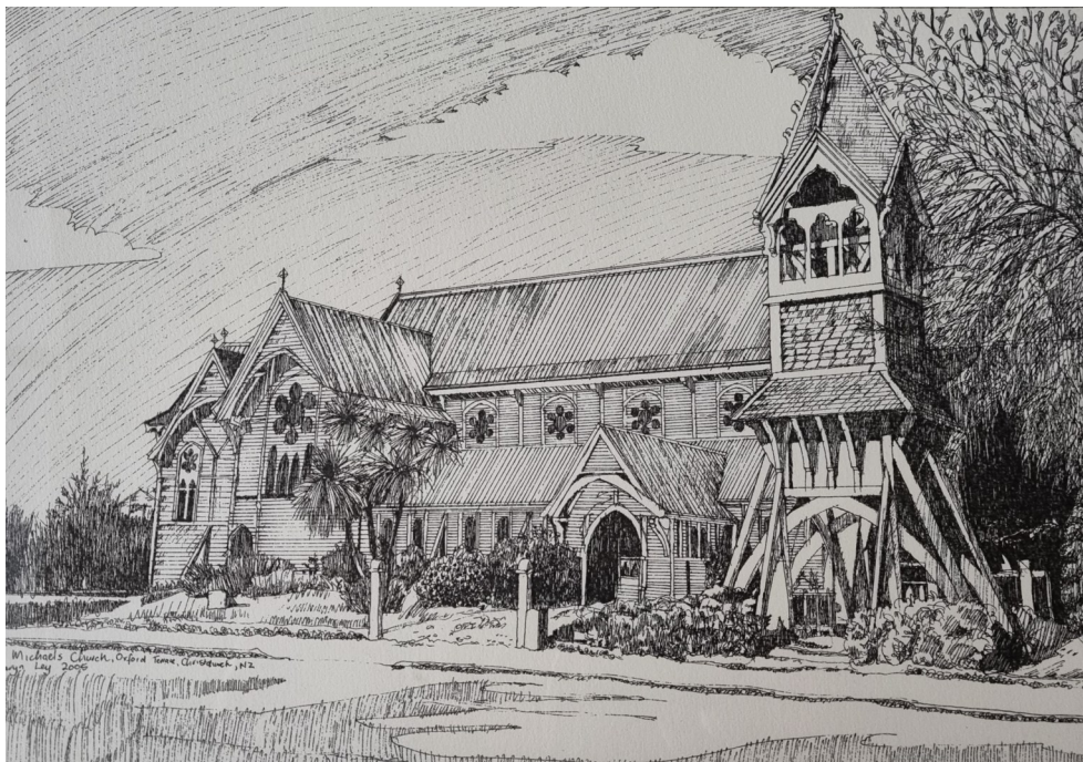
Artist: Sharyn Ley—2005

The Twenty-fourth Sunday of Ordinary Time 15 September 2024